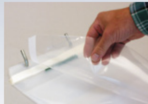
always to hand: "tear-off" mailing bags