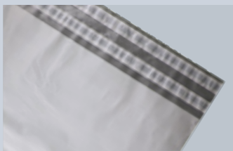
with permanent 10mm closure

DEBAPOST™ Second life mailing bags with Blue Angel certification for e-commerce and online shopping. Manufactured from more than 80% recycled waste, these mailing bags with PCR film provide a sustainable form of packaging for courier and mail order businesses. Using post-consumer recycling material is environmentally friendly and saves resources.