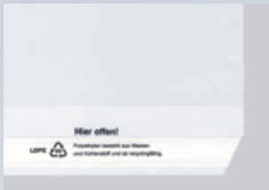
with print on flap

Individual solutions are also available on request.