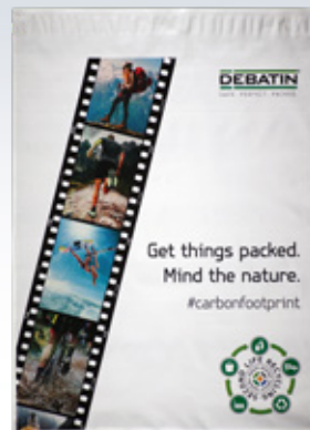
ideal for advertising: mailing bags printed to order in up to 8 colours