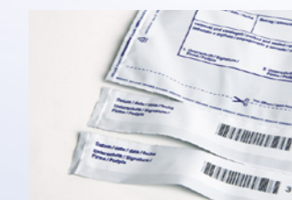
Multiple tear-off receipts