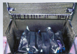
Non-incendiary transport case contents of bag reliably dyed