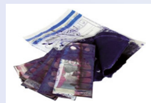
once triggered by tampering