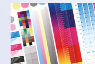
Up to 8 colour flexo-printing

DEBASAFE™ security bags are "made in Germany". Besides our standard range, our plant in Bruchsal is happy to manufacture customised security bags. You can specify size, print, closure and further special features - multiple tear-off receipts, for example, or an outer document pouch for freight papers or RFID tag. We'll make sure you receive your optimised, customised order right on schedule and in top quality.