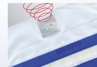
RFID tag (optional)