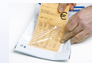
Extra document pouch for freight papers