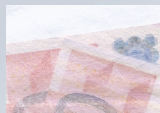
Pouch of bag made of non-woven fleece fabric